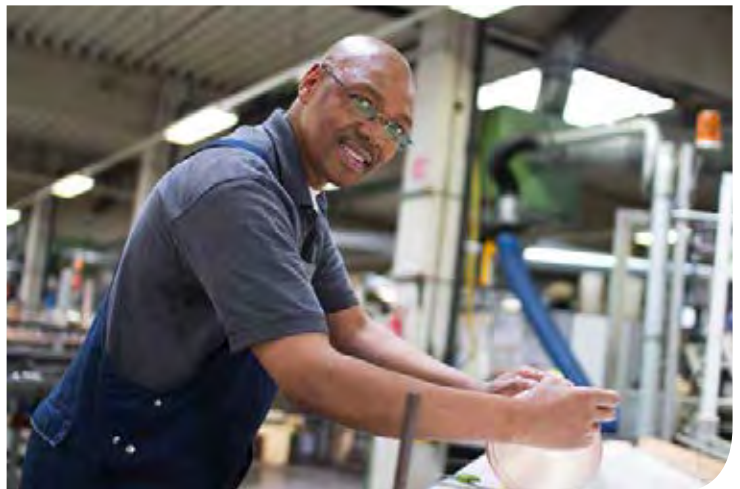
Applying the finishing to freshly-produced spiral hoses

Masterduct also sells all of our Masterflex and Novoplast Schlauchtechnik products in North and South America. With the wide range of products including profile-extruded hoses, smooth, film/foil and fabric clip hoses, as well as the templine® heated hoses, Masterduct offers solutions for the most challenging connection applications throughout all industrial and manufacturing sectors.