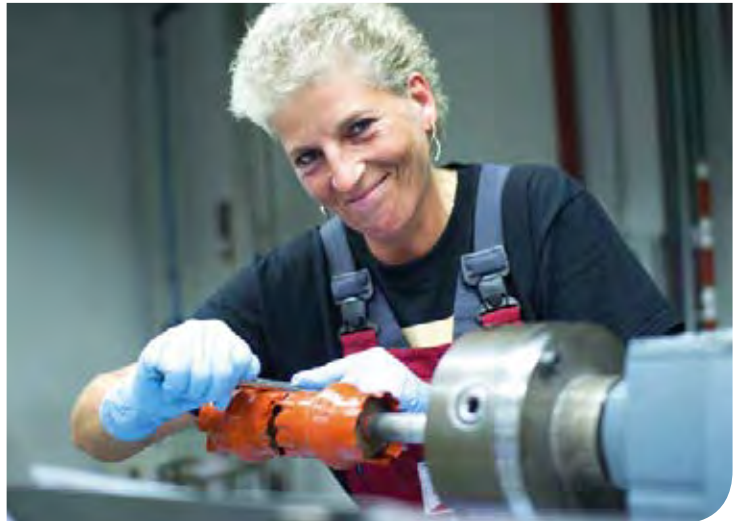
At our site in Norderstedt, Germany, we carry out production processes by hand to ensure the highest level of quality

These intricate yet robust products are manufactured in part by hand and ensure essential functions in a multitude of industrial applications. Yet another advantage is that batch sizes can vary greatly.