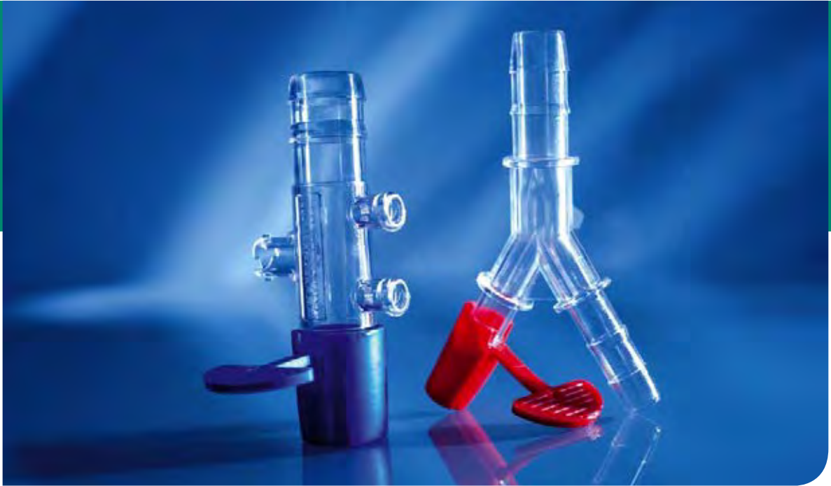
Tube connector with caps and Y-connectors for medical technology applications, such as heart and lung machines