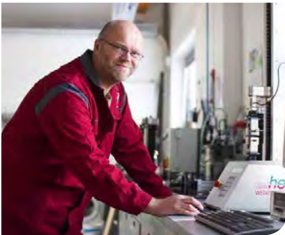
Testing materials in the incoming goods inspection department at Matzen & Timm

We serve customers all over the world: multinational companies with production sites and technical distributors around the globe, medium-sized commercial businesses, as well as the construction sector, manufacturers of medical technology and transport providers (road, air and rail). Our team advises you on-site, which is precisely where you need us and our expertise: in Europe, Asia and the Americas.