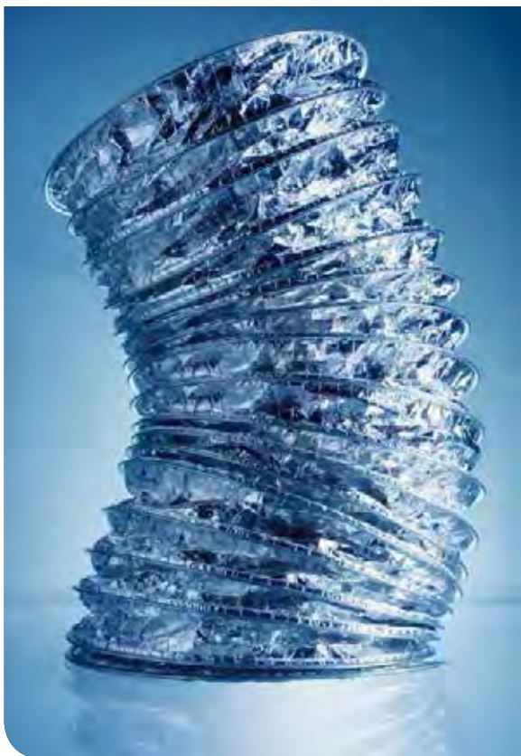
Fire-resistant metal spiral connection for building ventilation