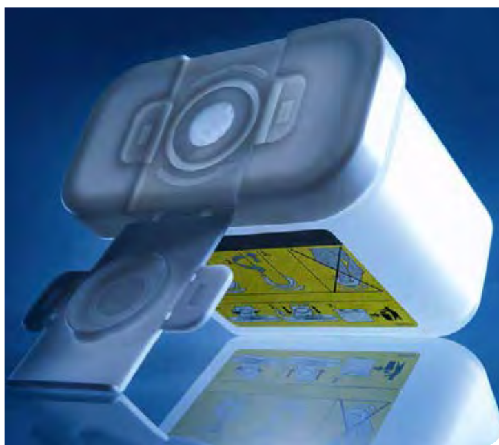
Cannula collection boxes: organisation made easy in medical rooms

Fleima-Plastic is always the obvious choice when it comes to seeking expert advice on the development of new products requiring individual or multiple injection-moulded parts. On the basis of ideas, sketches or a list of specifications, we transform our customers' plans into marketable products. Following the prototype phase, Fleima-Plastic is then able to swiftly start the managed production using its own precision moulding & tool construction facilities.