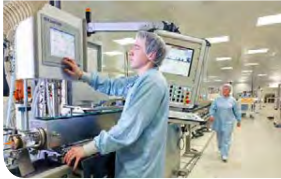
Specialist tubing for the medical technology industry is manufactured in the cleanrooms at Halberstadt, Germany

Throughout the world, virtually all processors are produced on machines which are controlled down to the micron by products from Novoplast Schlauchtechnik. Cars are manufactured by robots which are themselves manufactured using XFlame® hoses and pneumatic hoses from this brand.