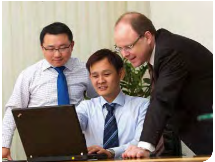
The management team for the Asian Region planning customer visits in China and Singapore

Masterflex combines innovative flair in the product development with a commitment to precision and quality in production. As a result, Masterflex is today already capable of providing long-term and durable solutions on a global basis to a multitude of demands in the field of connection systems. And our team of technical experts is even now working on the next generation of flexible connection solutions – the ‘multi-talented hoses’ of the future.