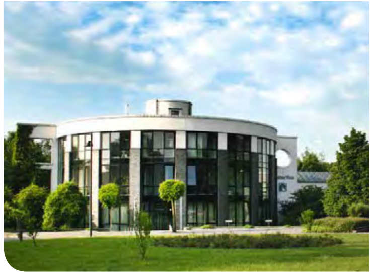
Our Headquarters in Gelsenkirchen in the German Ruhr district, Germany

What’s it all about? Our many years of expertise in the field of high-tech plastics – and not least the experience of our employees in a multitude of practical applications from industry and commerce – help us to meet these challenges.