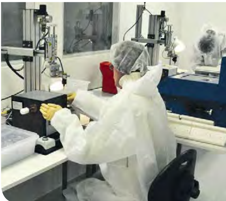
Rigorous testing in the cleanroom at Fleima-Plastic

Since its establishment in 1974, Fleima-Plastic has had its own mould-construction facilities. A large number of injection-moulded parts are further processed into installation-ready products or are installed in component assemblies. Fleima-Plastic ensures quality across all the processing stages; customers receive document-controlled quality products and benefit from low costs due to minimised logistics.