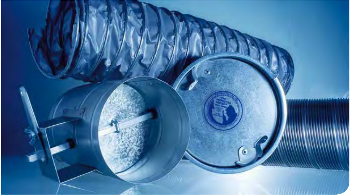
A selection of highly efficient metal connection elements for use in building ventilation