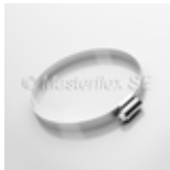
Hose clamp with worm-gear drive