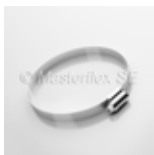
Hose clamp with worm-gear drive