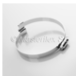
Car-Grip hose clamp, screwable