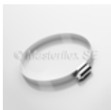
Hose clamp with worm-gear drive