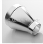
Hose reducer, symmetrical