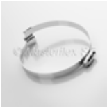
Car-Grip hose clamp, screwable